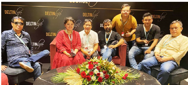
IT News Panaji, Nov 29