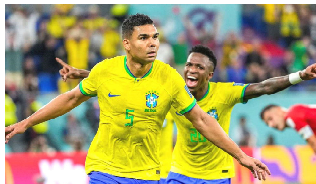
Brazil's Casemiro celebrates after scoring a goal.

Mohammed Kudus scored twice to help Ghana beat South Korea 3-2 in a World Cup Group H thriller at a rocking Education City Stadium on